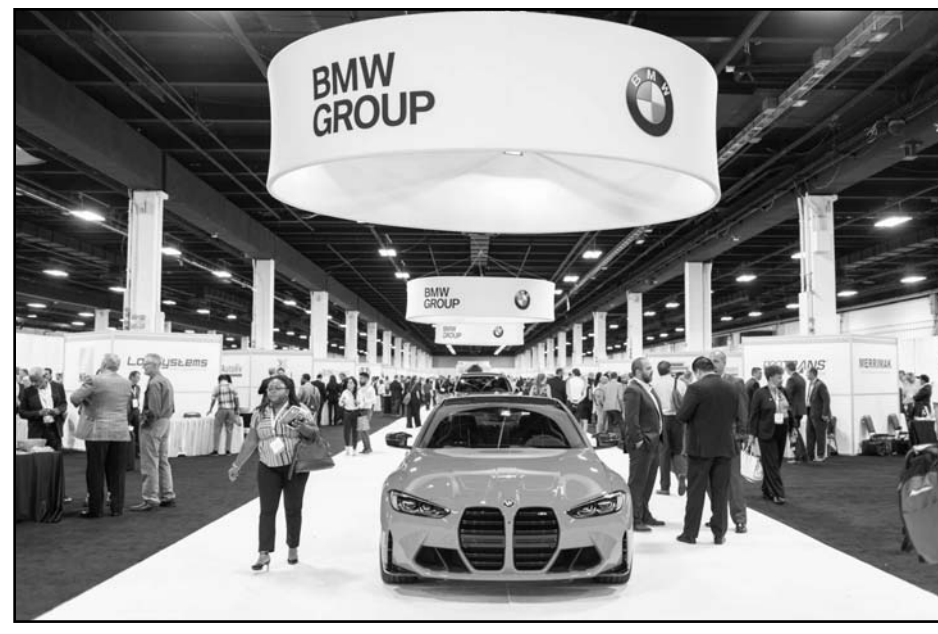
BMW recently hosted one of the nation's largest supplier diversity events on August 30 at the Greenville Convention Center.

This event will take place on Thursday, September 28, 5:00 p.m. - 8:00 p.m. at Indigo Hall Events, 190 Ezell Street, Spartanburg.