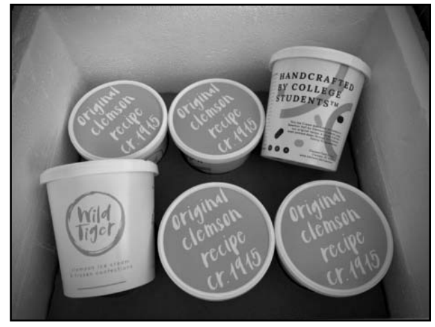
Six pints of Clemson ice cream can be shipped to customers nationwide.

"We operate just like any other small business, including paying rent to the university, as well as paying our student and professional staff," said