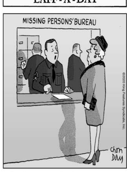
"Is this the same husband who was missing three times last year?"