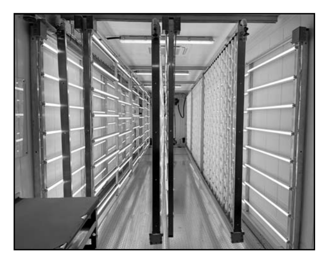
i ne South Carolina Governor's School for Science and Mathematics unveiled its Hydroponic Research Lab on September 8.

The GSSM Hydroponic Research Lab has the capacity to grow nearly