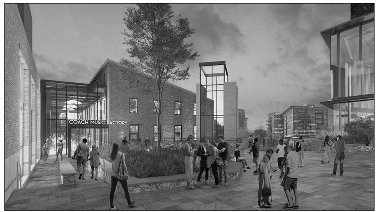
The Coach Music Factory will have a club vibe to satisfy serious live music lovers, and the size, acoustics, lighting, and other technical aspects that today's professional touring musicians demand.