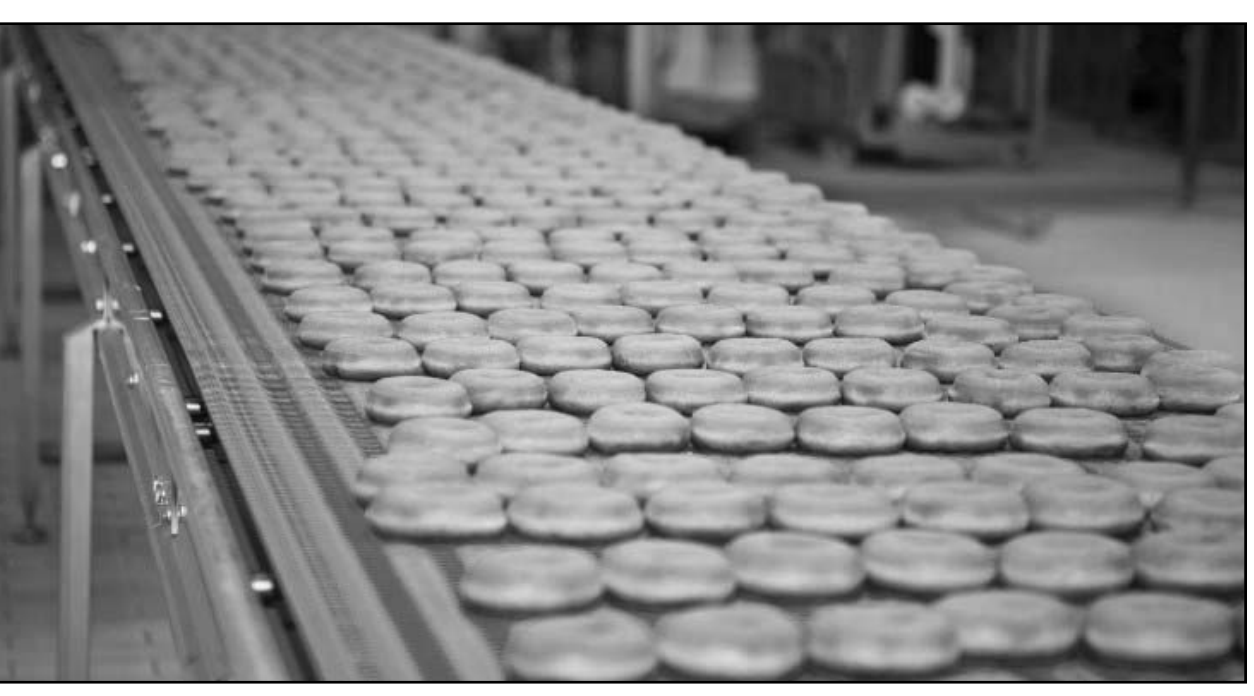
Europastry's $23 million investment in Laurens County will 155 new jobs.

"Europastry, a world leader in bakery products based in Barcelona, Spain with U.S. headquarters in Long Island, New York – is proudly announcing a new investment in a plant in Laurens, South Carolina. Laurens has become a strategic location, allowing the company to expand its footprint in the U.S. The new plant will start up operations soon, and more details will be provided in