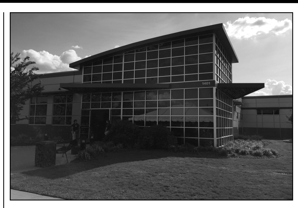
Spartanburg Community College celebrated the opening of its fifth campus on August 25th in Union County.

For more information on the Carolina Miracle League or to find out how you can be involved, call 864-579-1805.