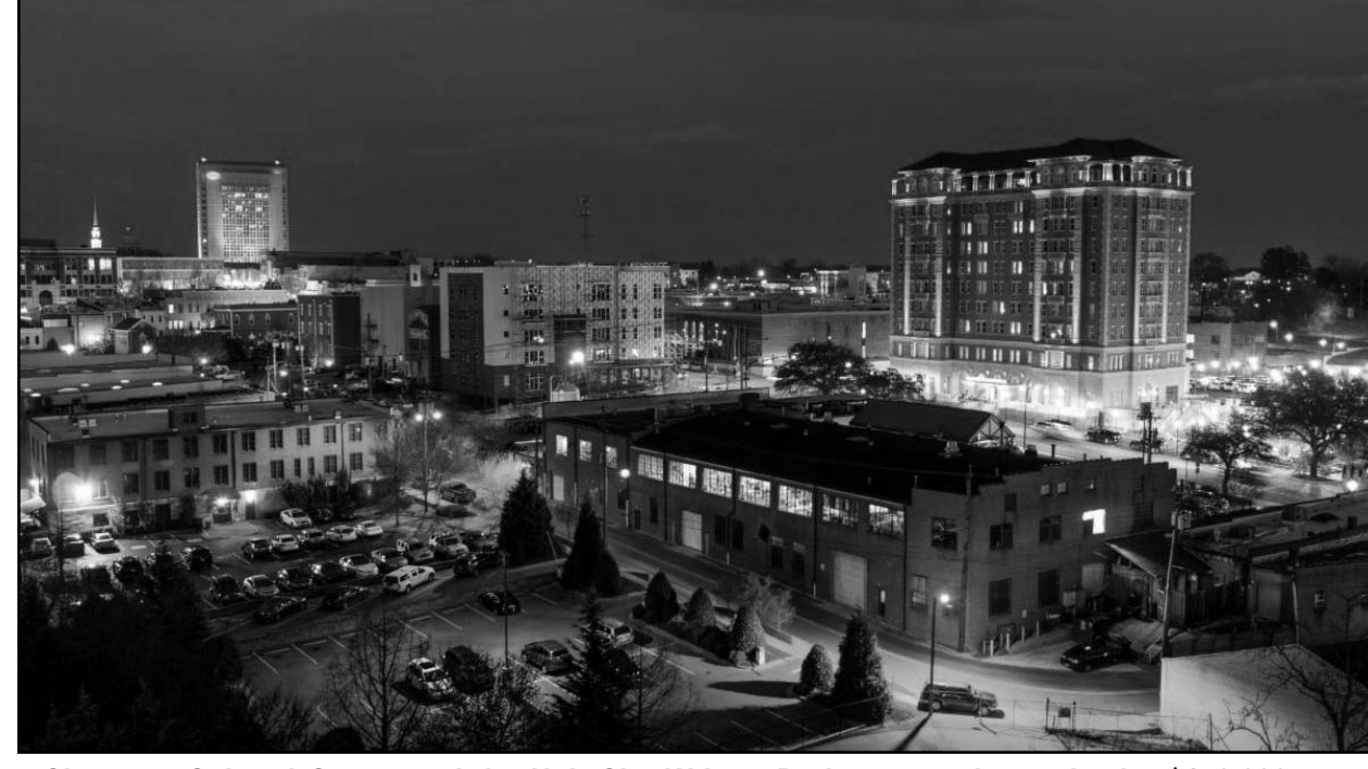
Chapman Cultural Center and the Hub City Writers Project recently received a $150,000 grant from the Weston-Brown Foundation.

"This grant is designed to create a life-changing experience for the fellows, to provide engaging intellectual opportunities for local students and citizens, and to create a model program for community cul-