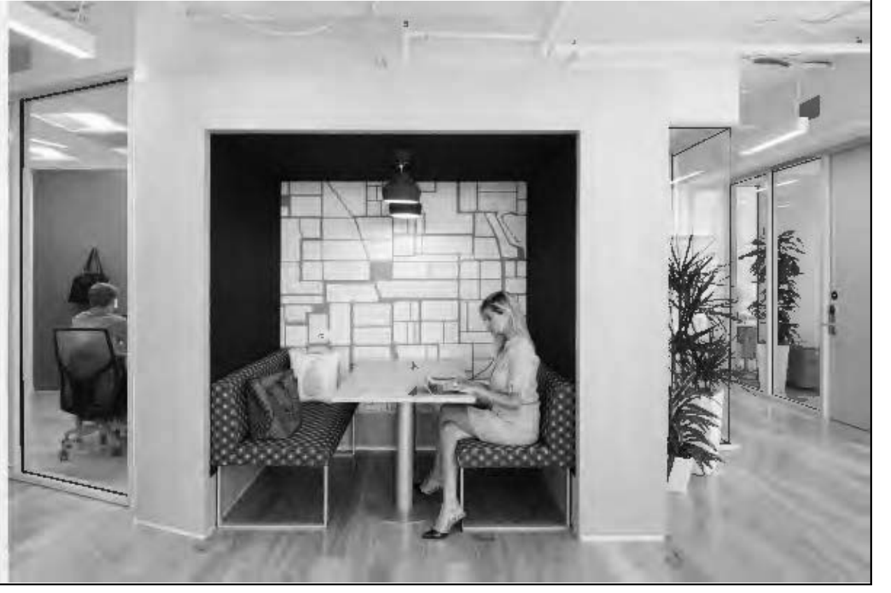
Coworking spaces are providing parents with better work-life balance.

The growth of flexible workspace means that people increasingly have access to these locations no matter where they are, offering users the potential to skip a long commute and work closer to home. So, what would parents do with that extra time? According to the Regus survey, the number one activity parents would spend their time on, instead of commuting, is being