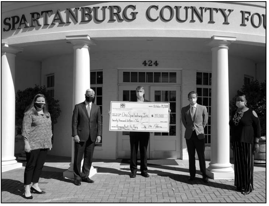
The Spartanburg County Foundation recently announced a $20,000 grant towards preserving local jobs and investing in the sustainability of Spartanburg County's racially diverse small businesses.

This newest horticulture endeavor joins a long list of flourishing green spaces and gardens on the Giles Campus - also known as the SCC Arboretum, which is one of five recognized arboretums in Spartanburg County. For more information about SCC and the Arboretum, visit: www.sccsc.edu/SCC-Arboretum