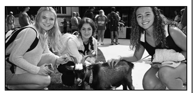
Latte the goat got lots of attention during Wofford's annual Blessing of the Animals on Wednesday, October 4.

The annual event began over a decade ago and is cele-