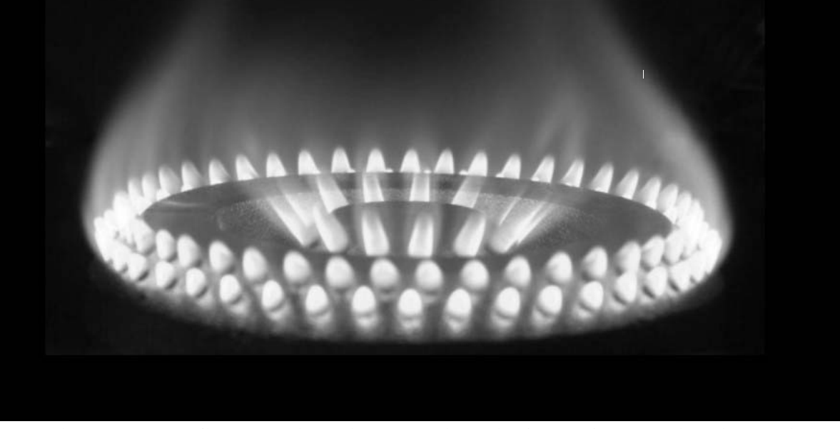
Piedmont Natural Gas recently issued its annual winter bills forecast for the coming winter period.

With seasonal cold weather on the horizon, Piedmont reminds cus-