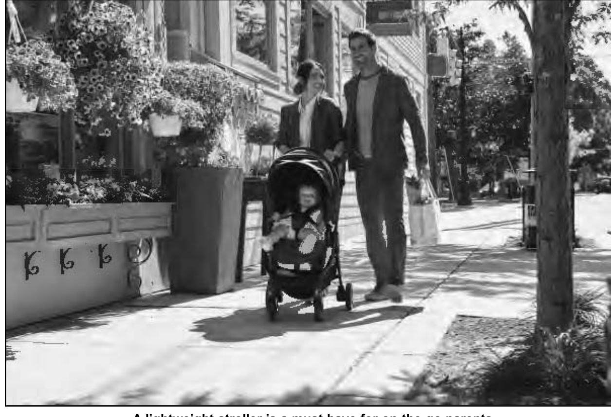
A lightweight stroller is a must have for on-the-go parents.

Never underestimate the importance of a weather shield to block wind and