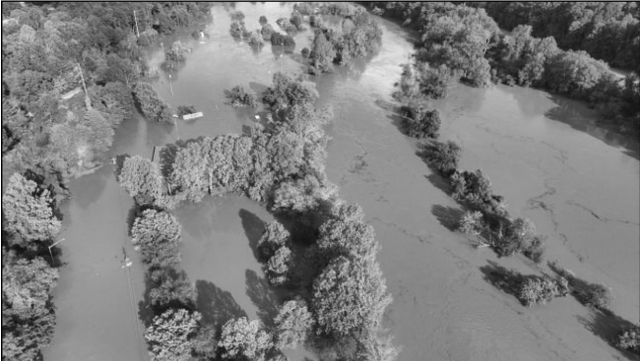
The Duke Energy Foundation recently announced a $1 million commitment to support communities impacted by Hurricane Helene.