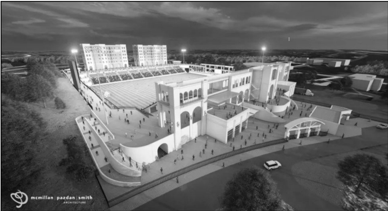
McMillan Pazdan Smith rendering of the new stadium that will be built at BridgeWay Station in Mauldin.

This project marks a significant step forward in positioning Mauldin and the greater Greenville area as a premier destination for sports tourism and community gatherings in South