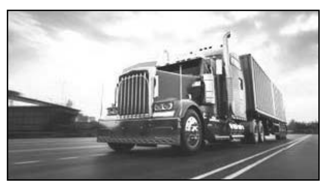
Canal Insurance Company is relocating a new headquarters location on North Main Street in downtown Greenville.

"As a family-owned company, we have considered Greenville home for more than 80 years and share a keen appreciation for the advantages of expanding operations and recruiting employees in such a vibrant city and business environment. We