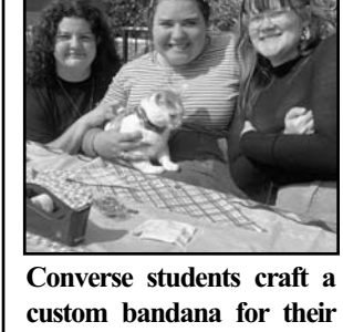
cat. Converse University

The College of Healthcare Information Management Executives (CHIME) is an executive organization dedicated to serving chief information officers (CIOs), chief medical information officers (CMIOs), chief nursing information officers (CNIOs), chief innovation officers (CIOs), chief digital officers (CDOs) and other senior healthcare IT leaders. With more than 5,000 members in 58 countries plus two U.S. territories and over 190 healthcare IT business partners and professional services firms, CHIME and its three associations provide a highly interactive, trusted environment enabling senior professional and industry leaders to collaborate, exchange best practices, address professional development needs and advocate the effective use of information management improve the health and care in the communities they serve. For more information, please visit chime central.org.