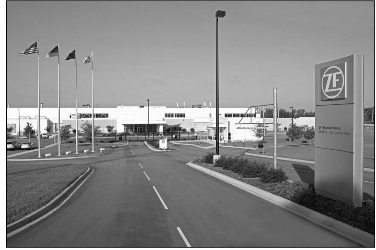
ZF Group recently announced that it will invest $500 million to expand it's Gray Court manufacturing facility, creating 400 new jobs.

remains a critical part of our major e-mobility transformation in North America and globally. Having the capability to produce the propulsion systems of today, and e-mobility products of tomorrow, under