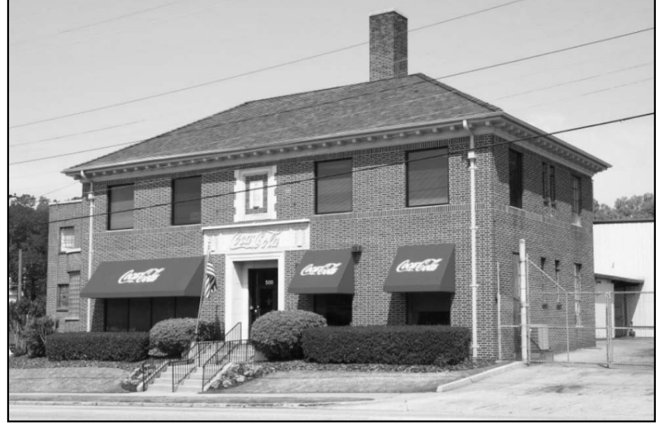
Spartanburg City Council recently approved a development agreement for the redevelopment of the former Coca-Cola distribution center.

A crosswalk from Heywood Ave. to the continuation of the trail on Beverly Rd. is coming soon.