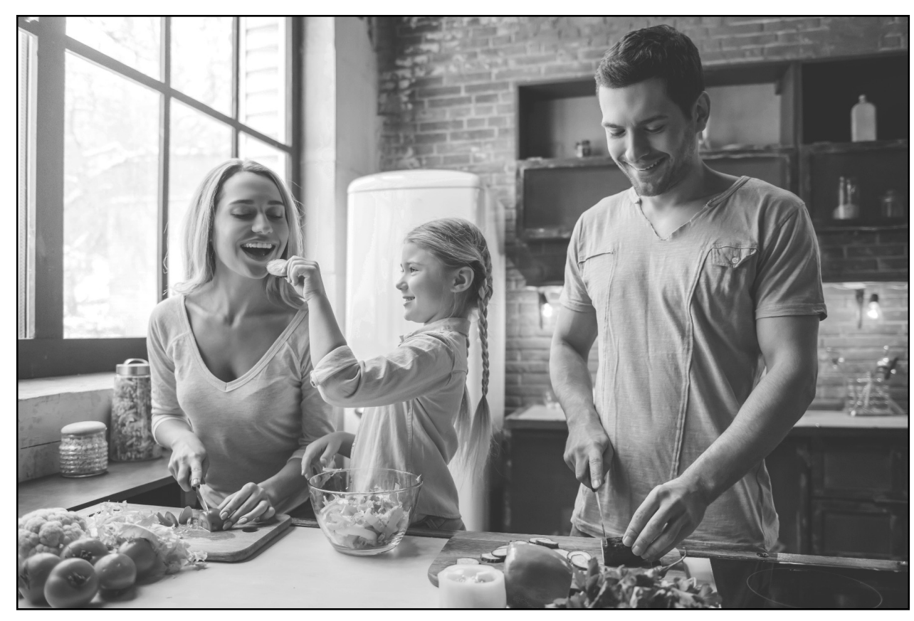
Stay healthy this holiday season by following these steps.