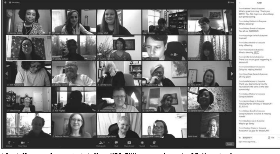
'Just Because' grants totaling $21,500 were given to 13 Spartanburg area nonprofits at the Virtual Nonprofit Thankful for You Celebration held November 10.

more info, please visit online: ArtistsCollectiveSpartanburg.org.