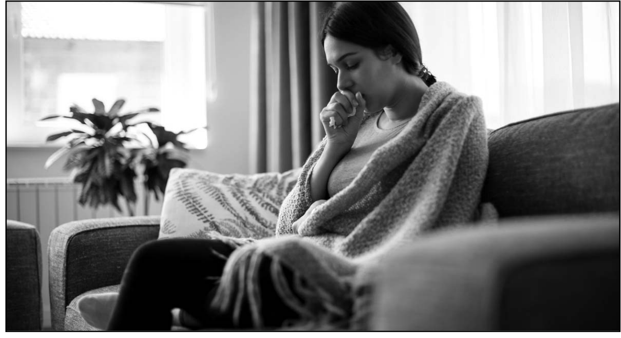
Flu season is off to an early start in 2022.