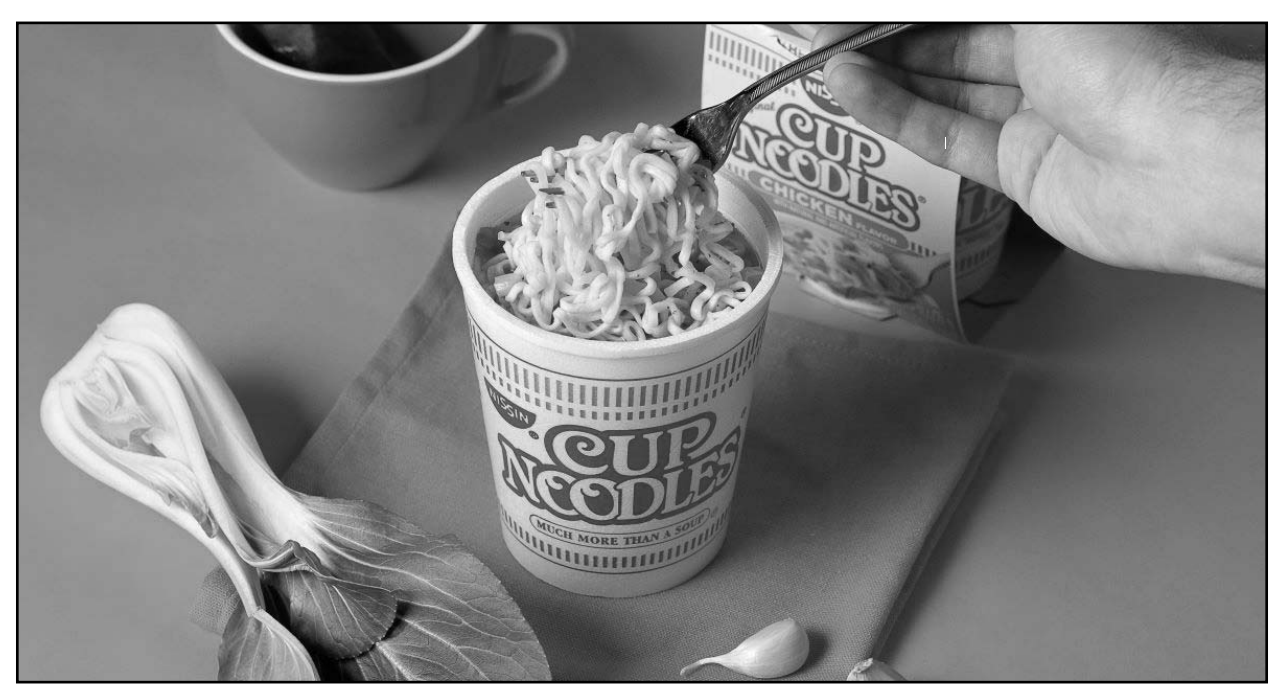
Nissin Foods recently announced that it would purchase property in Piedmont for a new manufacturing facility.

"Greenville is among the fastest growing manufacturing cities in the country, and many other top brands are produced there," added Price. "In addition to being