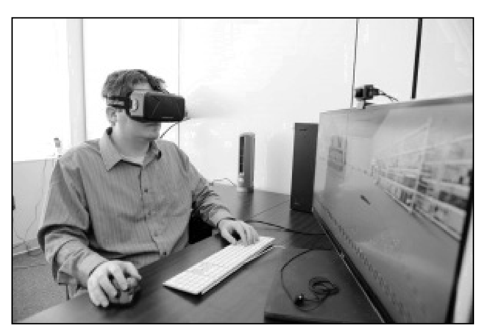
Virtual reality is incorporated into some of the EducateWorkforce courses that some see as the future of education in the state.