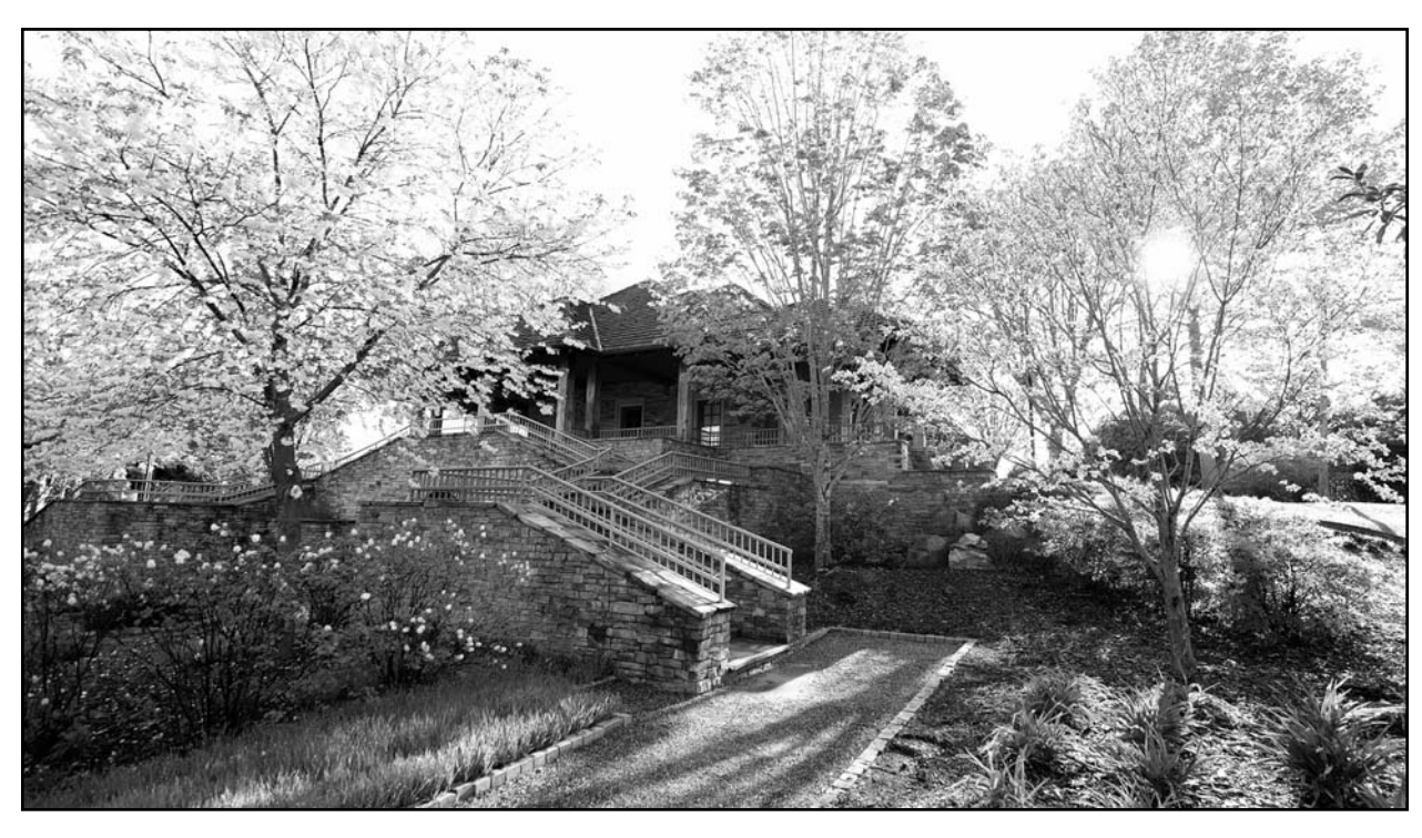
The Shi Institute in the spring of 2020.

ronmental scientists and economists, urban planners and policy experts, sustainability leaders and elected officials will collaboratively pursue sustainable communities at the Shi Institute, which operates in a net zero, sustainable showcase home in the heart of Furman's campus.