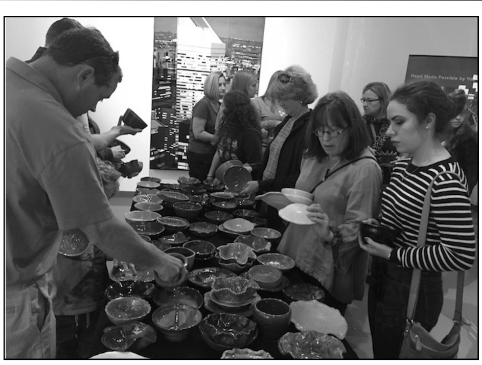
Carolina Clay Artists will donate $33,000 to TOTAL Ministries as a result of the 2016 Hub City Empty Bowls project.

Finally, Vulcan's donation supports GSSM's STEM-centered satellite day camps for rising 7 - 9th graders in Greenville County for two weeks during the summer. iTEAMS Xtreme: Next Generation focuses on science, technology and robotics, while CREATEng is a project-based camp that encourages students to apply principles of engineering to solve challenges.