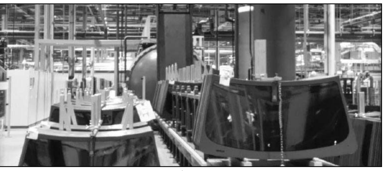
Fuyao Glass America recently announced a $34.5 million expansion to its Fountain Inn location which will add 121 new jobs.

"We are excited to expand our manufacturing footprint in Greenville County and the Upstate, a key region for the automotive industry. This expansion will strengthen our relationship with our customers and accommodate increased demand of our products," stated Fuyao