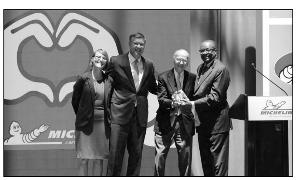
Michelin North America recently released its first diversity and inclusion report.

The concerts are made possible by Furman University and are sponsored by the Bank of Travelers Rest, George Coleman Ford (Travelers Rest), The Greenville News, Publix Supermarkets Charities, The Woodlands at Furman, Greenville Health System, and Pecknel Music.