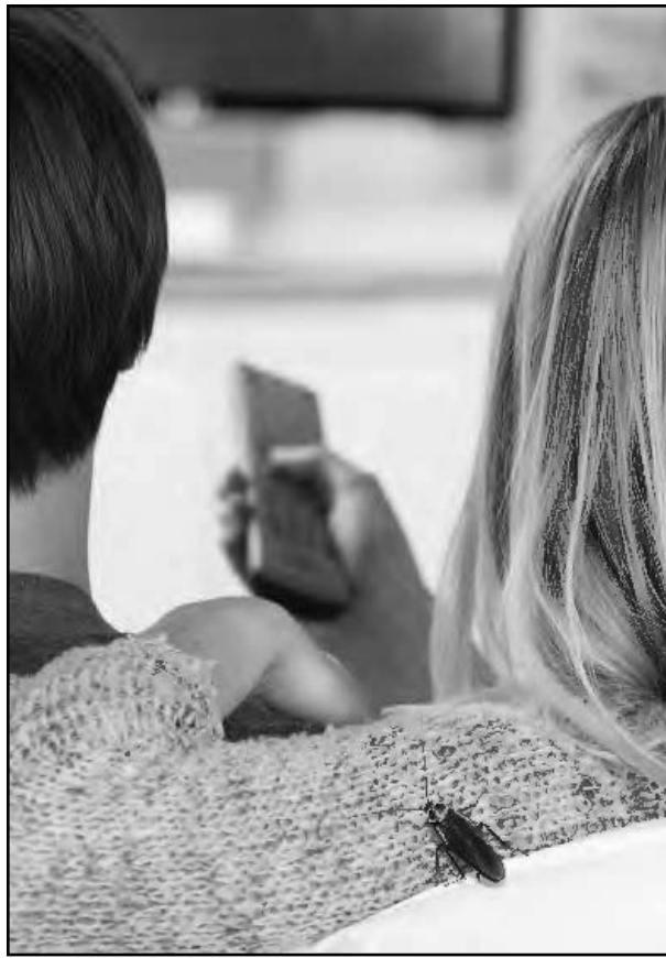
Don't let pesky pests drop in on movie night.

• Bug Killer Spray: The last thing people want during quarantine is to share their home with pests. Unfortunately, due to a warm winter and wet spring, the forecast for ants, roaches, mosquitoes and more predicts a very buggy 2020. With so much additional time spent around the house, selecting products without harsh chemicals and odors makes a lot of sense. Zevo Instant Action Sprays with BioSelective Technology use essential oils to attack nervous system receptors