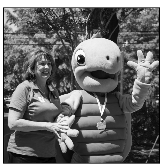
Spartanburg Regional Healthcare System recently unveiled its new pediatric mascot, Shelldon the Turtle.

sen, pediatric patients colored his picture and suggested a name with their art. The top names were narrowed down to three: Speedy, Shelldon and Shelly. The community cast almost 3,500 votes, and Shelldon was the winner.