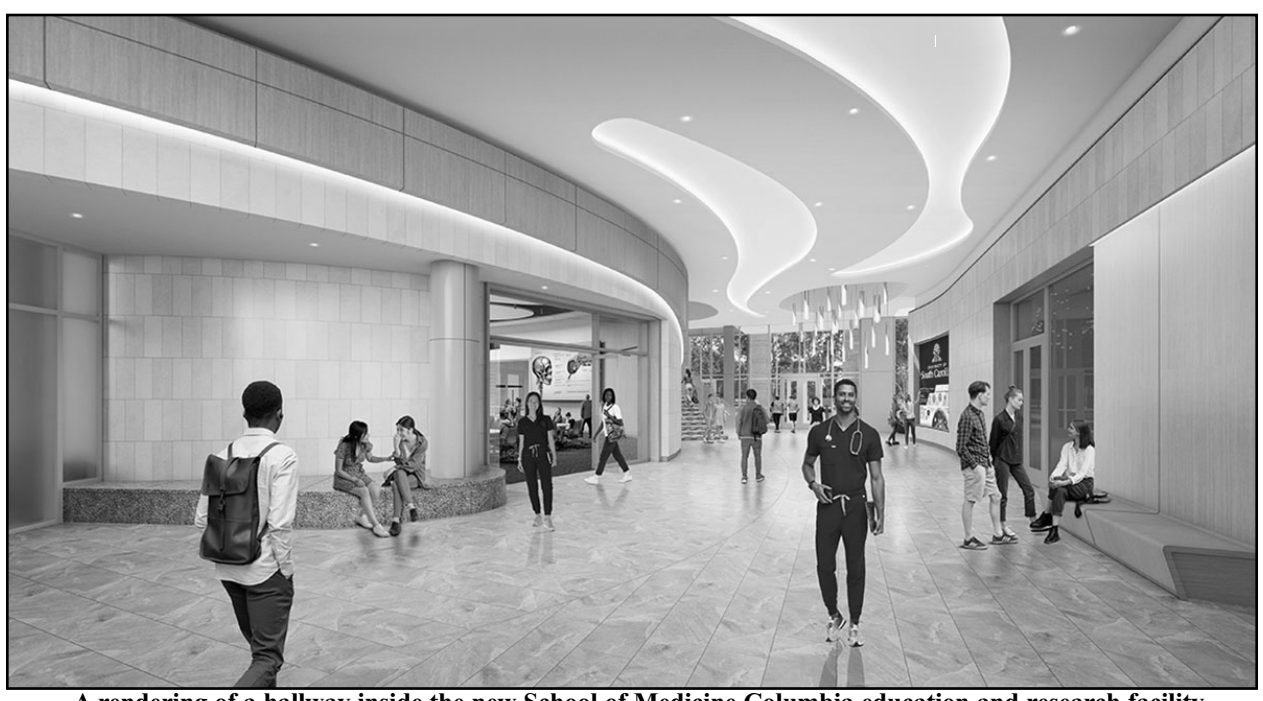
A rendering of a hallway inside the new School of Medicine Columbia education and research facility.

tion and collaboration in mind, the facility will feature modern classrooms, medical simulation spaces, a health sciences library, interdisciplinary research labs and a café. Outdoor courtyards and green spaces will provide serene environments for study and connection to foster a vibrant academic community for students, faculty and staff.