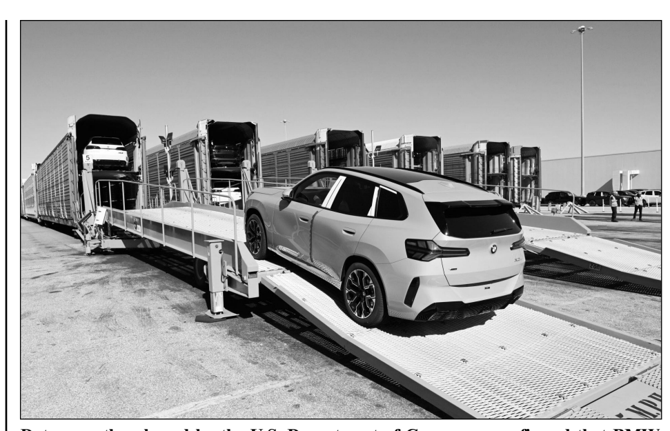
Data recently released by the U.S. Department of Commerce confirmed that BMW Manufacturing was the leading automotive exporter in the United States in 2024. Plant Spartanburg exported nearly 225,000 vehicles during the year.

Donate online at https://activeliving.networkforgood.com/ projects/244431-wildflower-way-trail-and-the-rainbowbridge?utm_campaign=dms email blast 3849790. Thank you for supporting PAL and helping us build Spartanburg's trails!