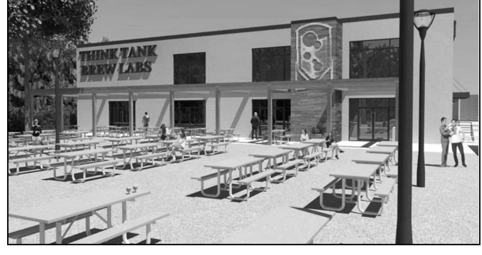
Think Tank Brew Lab is planning a summer 2018 opening.

The property, owned by Sykes Workman Leasing, includes over 21,000 SF of former industrial space with high ceilings and direct access to the expanded Swamp Rabbit Trail. Included with the