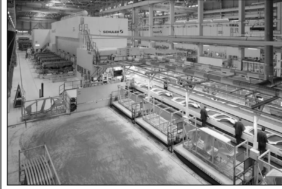
BMW recently announced it is investing more than $200 million to construct a 219,000-square-foot press shop at its Spartanburg County plant.