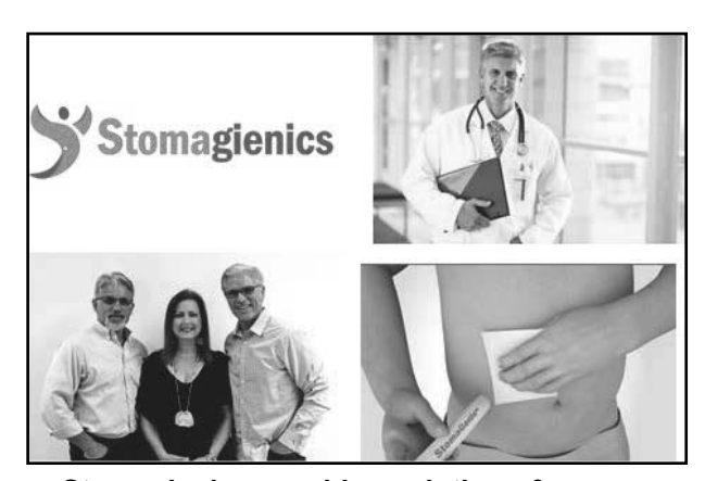
Stomagienics provides solutions for cancer survivors and others who have undergone ostomy surgery.

Located in expanded facilities at 1200 Woodruff Road in Greenville,