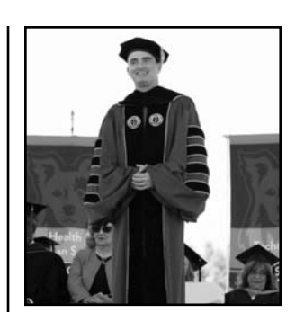
SCC held 2023 graduation ceremonies on May

More about the center may be found on the website (www.benmaysfamilycenter.org).