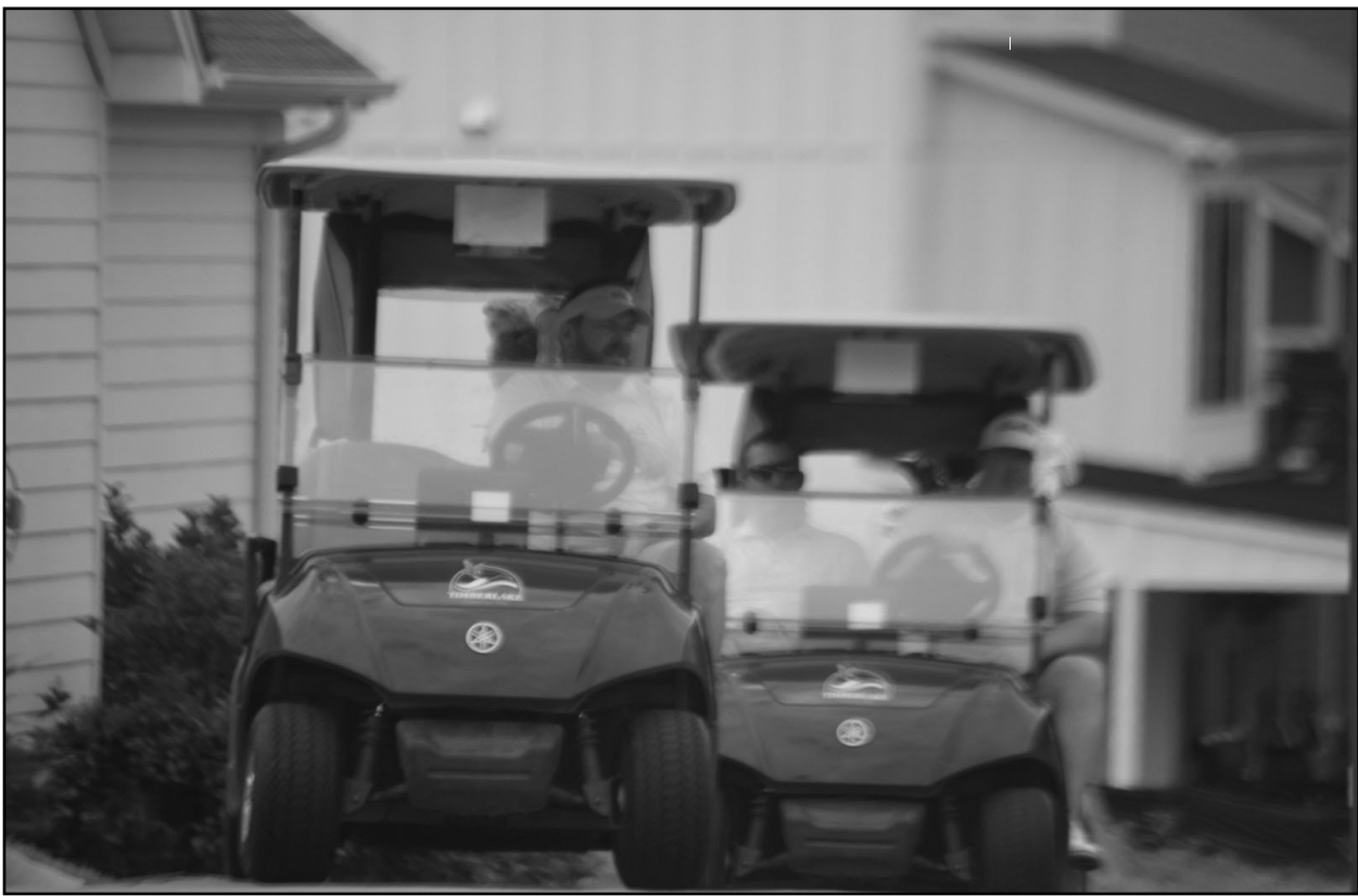
Golfers drive carts through the streets of Timberlake golf community near Chapin on Saturday, May 24, 2025.

The Orangeburg Democrat works as an attorney and has handled such cases as part of his law practice.