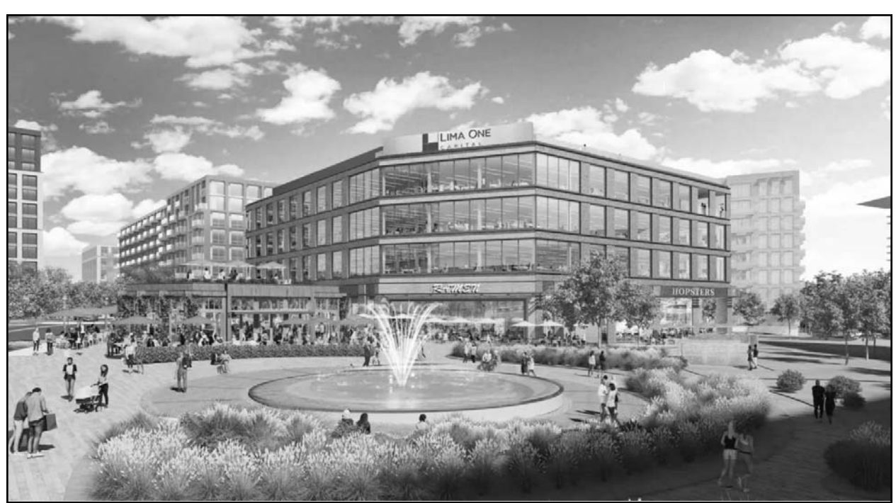
Greenville-based Lima One Capital recently announced it is investing $15.4 million to expand its headquarters to be a part of the County Square redevelopment project.

Utilizing industry-leading technology, Lima One Capital relies on in-house underwriting, construction