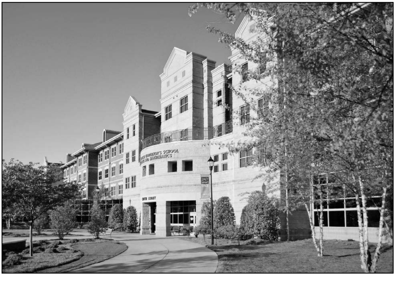
GSSM recently received a $10,000 grant from the Milliken & Company Charitable Foundation.

Milliken The & Company Charitable Foundation harnesses the spirit of Milliken giving to serve the numerous communities where the global