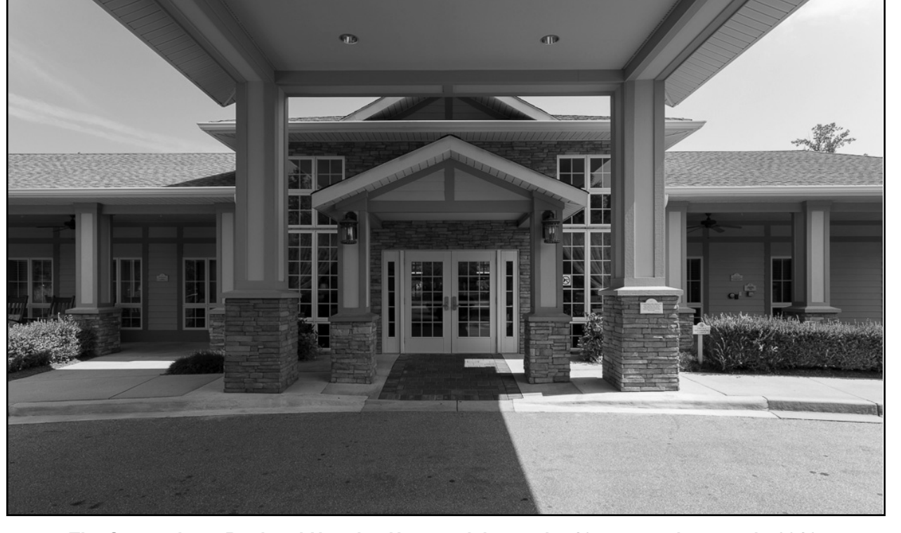
The Spartanburg Regional Hospice Home celebrates its 10 year anniversary in 2016.

Ten years later, the Spartanburg Regional Hospice Home has served 2,865 patients to date, with an average of 300 admissions per year, and has earned a reputation for sensitive and quality care for patients and families at a difficult