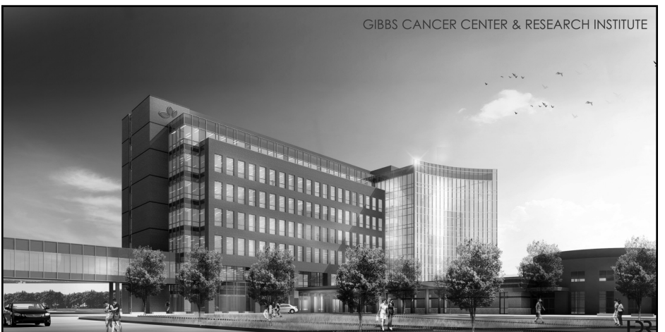
Gibbs Cancer Center & Research Institute recently broke ground on their new facility at Pelham.

Medical teams will work together in this seven-story building, where multidisciplinary experts from numerous specialties will discuss each patient's healthcare plan and treat-