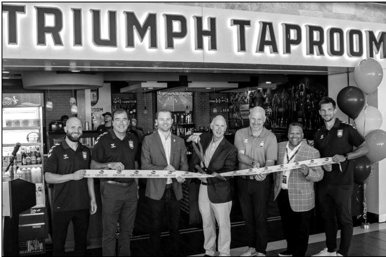
The Triumph Taproom, a new restaurant experience at Greenville-Spartanburg International Airport, celebrated with a ribbon-cutting on June 20.

Greer – The Greenville Triumph and Liberty partnered with Greenville-Spartanburg International Airport (GSP) to introduce the Triumph Taproom, a new restaurant experience at GSP. The Triumph Taproom is only the second soccer-themed restaurant and bar located in a North American airport, following City Pub at Orlando International Airport (MCO). Located on the A Concourse, the restaurant features Triumph and Liberty jerseys, pictures and memorabilia throughout the space and was officially opened with a ribbon-cutting ceremony on Thursday, June 20.