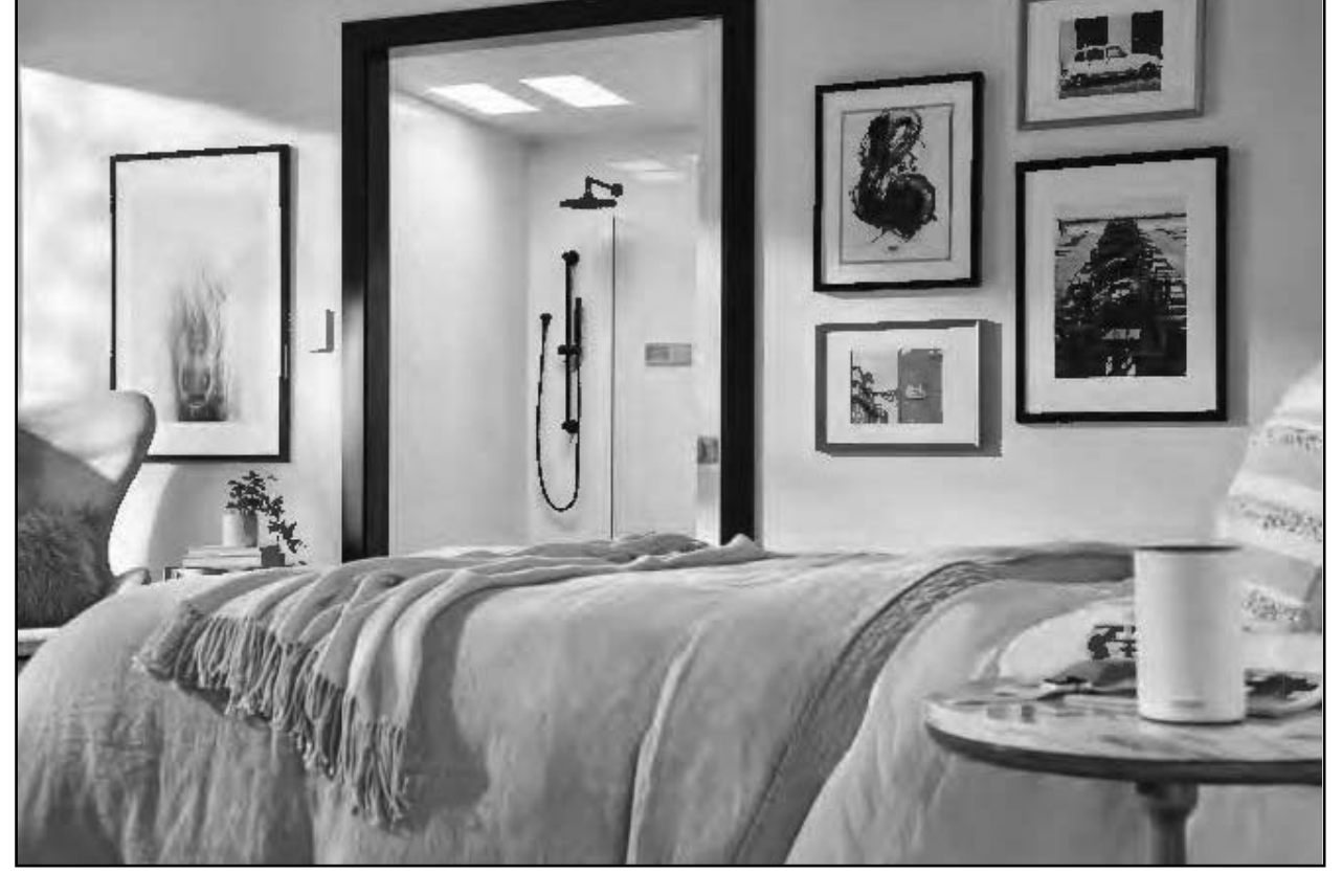
Smart showers and voice assistants are becoming popular wedding registry items.

Leading faucet manufacturer, Moen, commissioned a survey conducted online by Harris Poll in March 2018, which investigated what smart products would top the list when it comes to millennial (ages 18-34 at time of survey) wedding registries and how this tech-savvy generation may be reinventing the process of registering.