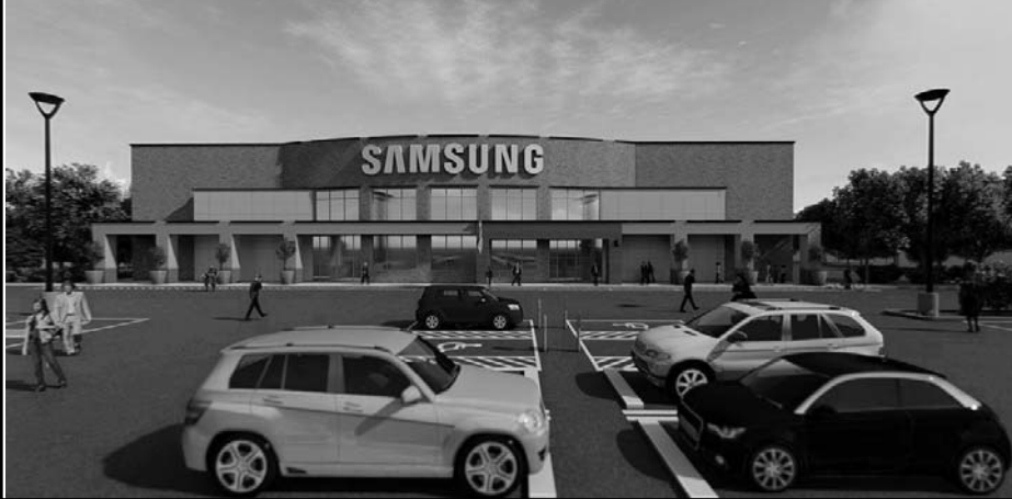
Rendering of the new Samsung Connected Customer Center in Greenville, South Carolina.

To date, 71 percent of U.S. households have at least one Samsung device, and nearly one third of U.S. households have three or more Samsung products. These numbers grow every day, as do the way consumers use their products. For years Samsung has been investing in delivering major, transformative benefits to the way consumers use Samsung devices - extending and expanding the way each product works together to create continuous user experiences. The new site will help support consumers' desire to seamlessly connect their devices and will ensure they get the most out of Samsung's products and service offerings.