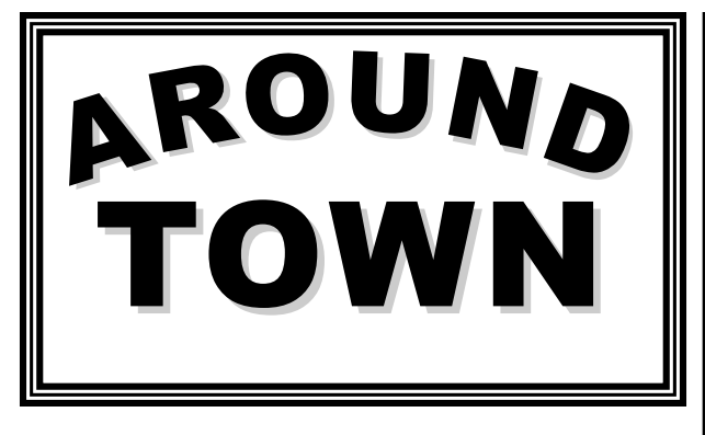
Community news from Spartanburg and the surrounding upstate area Visit us online at www.spartanweeklyonline.com

Spartanburg-based Lucie Medical named member company of SCRA - Page 2