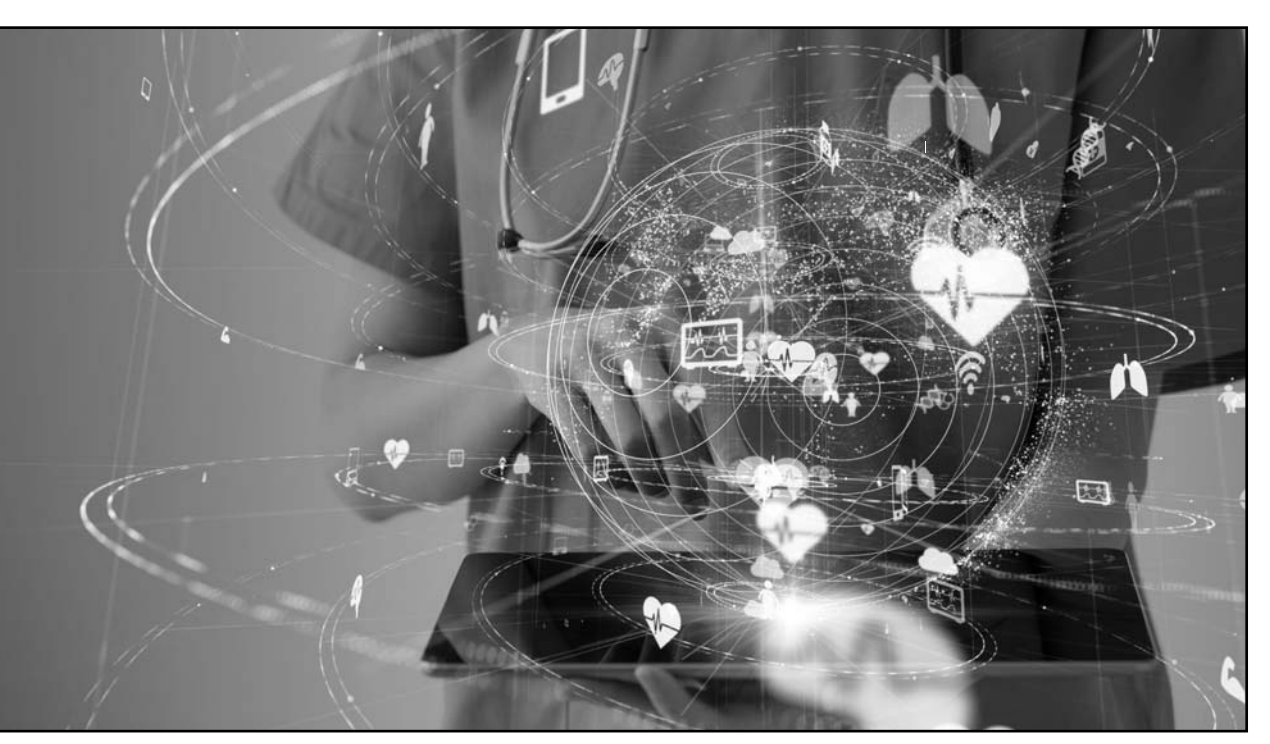
The South Carolina Research Authority recently named Spartanburg-based Lucie Medical as one of their new members.

Efferent Labs Inc. has also been accepted as an