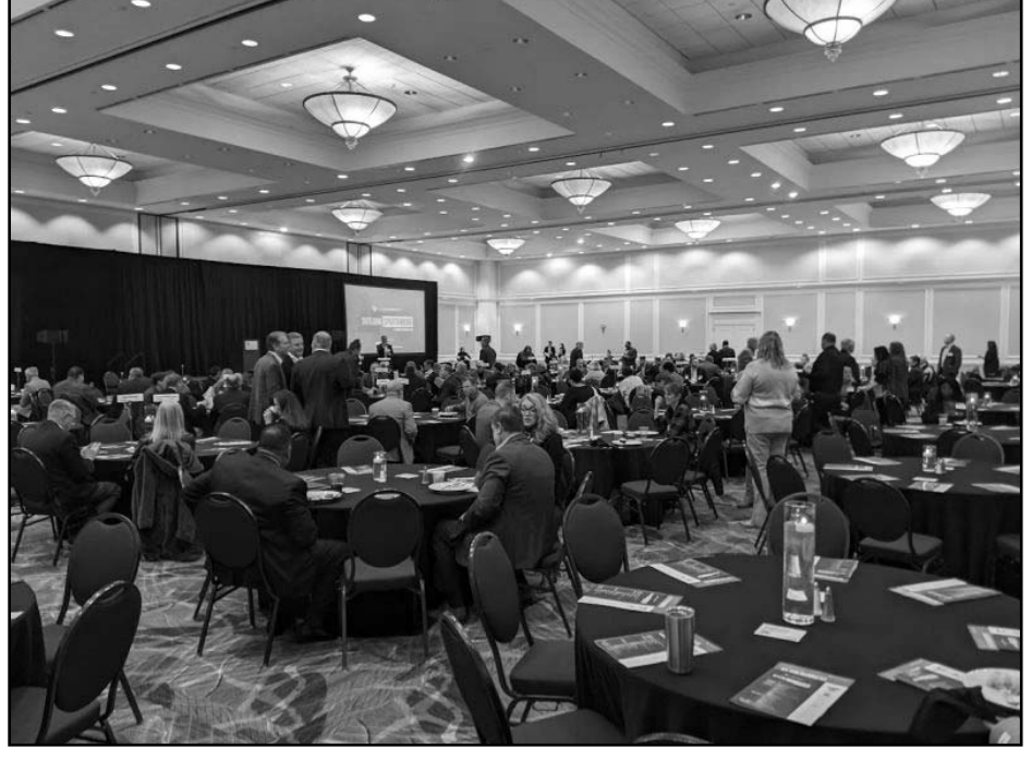
OneSpartanburg, Inc. landed 24 economic development projects for Spartanburg County and the City of Spartanburg in 2023.

January 18 at 7:30 pm | January 20, 21 at 3:00 pm Calling out around the world, are you ready for a brandnew beat? Put on your best dancing shoes and get ready for a non-stop musical trip to Motor City, in this electrifying tribute to the legends who invented the iconic Motown sound. Featuring dozens of hits by acclaimed soul artists Marvin Gaye, Gladys Knight, the Supremes, Martha and the Vandellas, the Jackson 5 and many more, this live musical event will have everyone "dancing in the street"! The performances will be held at Chapman Cultural Center, 200 East Saint John Street, Spartanburg, Visit www.chapmancultural-