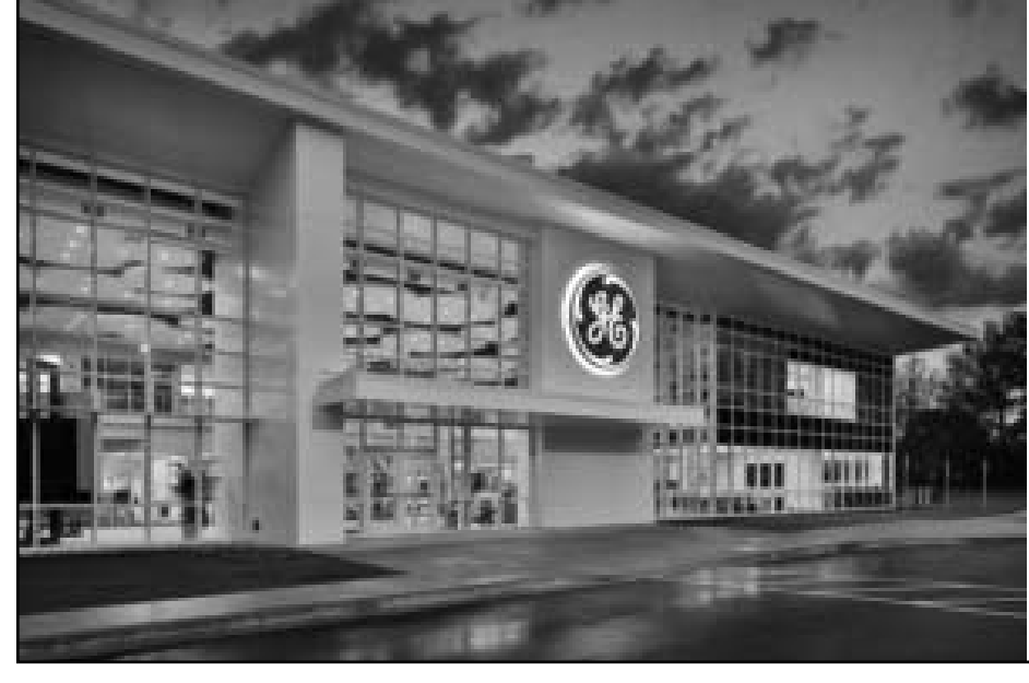
GE Power's Advanced Manufacturing Works facility in Greenville.

"Our state is a leader in advanced manufacturing