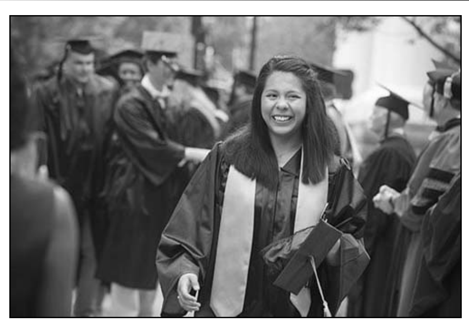
Spartanburg Methodist College has received federal approval to offer first four-year degree this fall.

certification program in South Carolina. Visit http://www.cerra.org/teacher-expo.html for details.