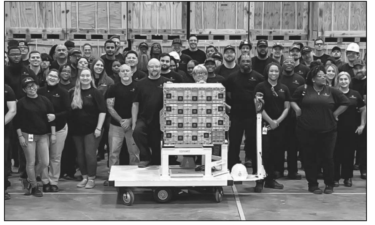
Proterra recently announced that the company has produced the first Proterra Powered EV battery at its new Powered 1 battery manufacturing plant located in Greer, South Carolina. By achieving this end-to-end production milestone at Powered 1, Proterra is expected to begin deliveries to customers of Proterra Powered<sup>TM</sup> battery systems from the new battery factory in the first quarter of 2023.

"Today marks an important step forward in our journey company's towards shaping an allelectric, emissions-free future. Achieving this important milestone at Powered 1 a little over a