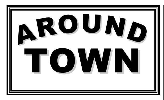
Community news from Spartanburg and the surrounding upstate area Visit us online at www.spartanweeklyonline.com

OneSpartanburg, Inc. among organizations across state receive funds to support innovation and entrepreneurship