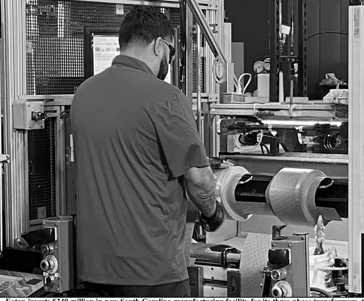
Eaton invests $340 million in new South Carolina manufacturing facility for its three-phase transformers, the company's third in the U.S.

The new operation will manufacture three-phase transformers, which sup-