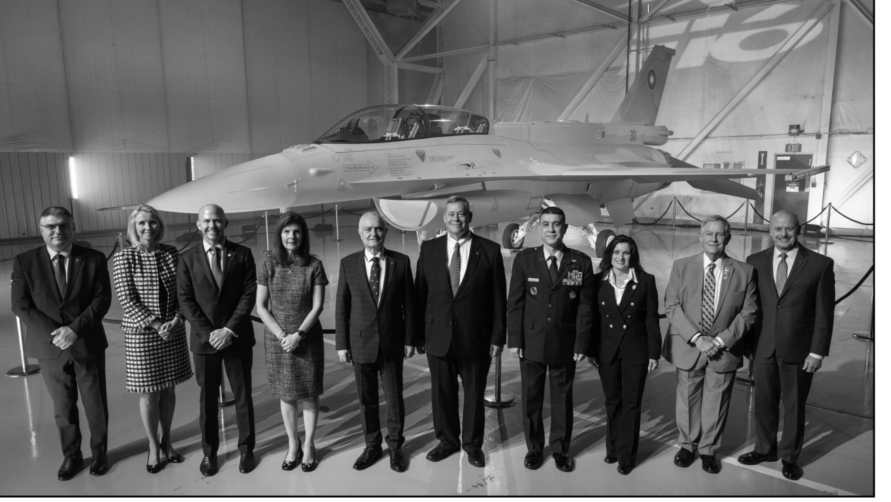
Lockheed Martin recently announced the delivery of the first F-16 Block 70 jet to Bulgaria. F-16s are built in by the Lockheed Martin team in Greenville.

"The F-16 will help the Bulgarian Air Force stay ahead of threats in the region and play a key role in the allied peacekeeping mission in Europe and around the world," said