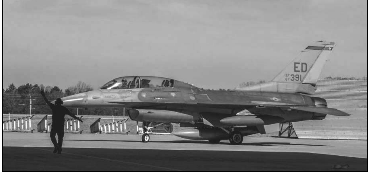
Lockheed Martin recently completed assembly on the first F-16 fighter jet built in South Carolina.

Lockheed Martin currently has orders from five countries for 128 aircraft -part of a $62 billion contract with the U.S. government to build aircraft for foreign allies. The company expects up to 300 new orders for the F-16, and recently announced addition of 300 more jobs at its