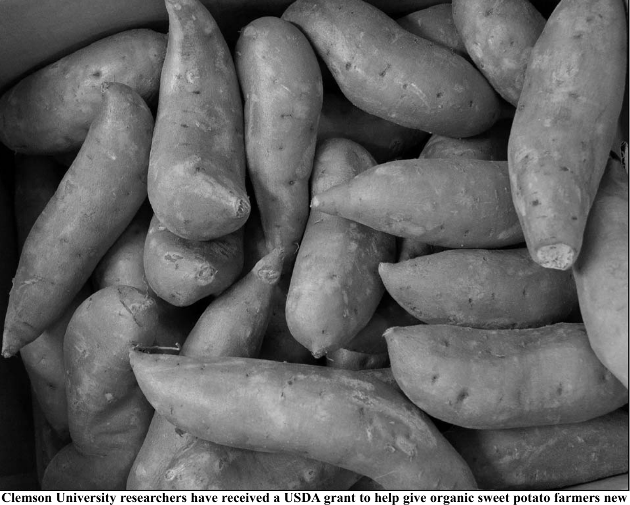
weapons to use against nematodes and weeds.

Anaerobic soil disinfestation (ASD) is a soilborne disease management strategy proven effective against a wide range of pathogens in organically-