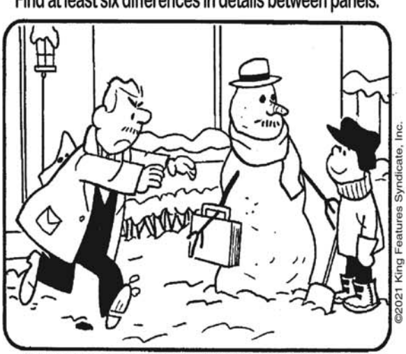
Differences: 1. Mustache is added. 2. Glasses are removed. 3. Boots are