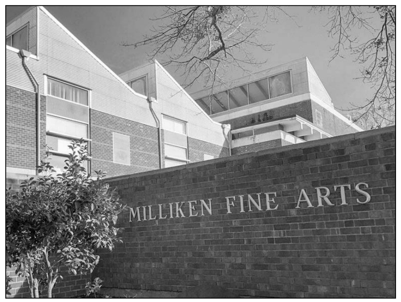
The Milliken & Company Charitable Foundation recently committed $2 million to Converse University.

award-winning The Milliken Fine Arts Building houses Converse University's Department of Art and Design and the Milliken Art Gallery.