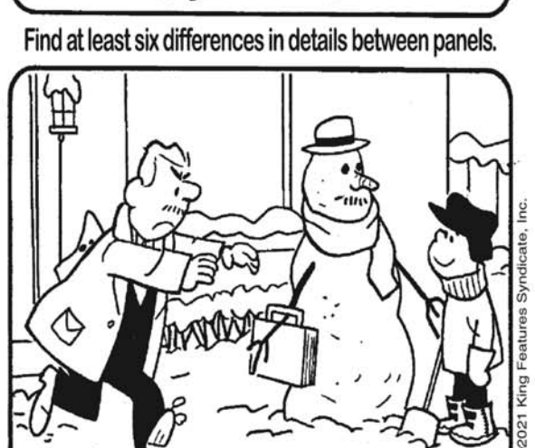
different. 4. Pocket is added. 5. Pants are different. 6. Button is missing.

dark-iramed column spells "North Pole." 5. Chubby, 6. Rudolph. 7. Jolly, 8. Elves. 9. Kringle. The Answers: 1. Nose. 2. Nicholas. 3. Grinch. 4. Stocking.