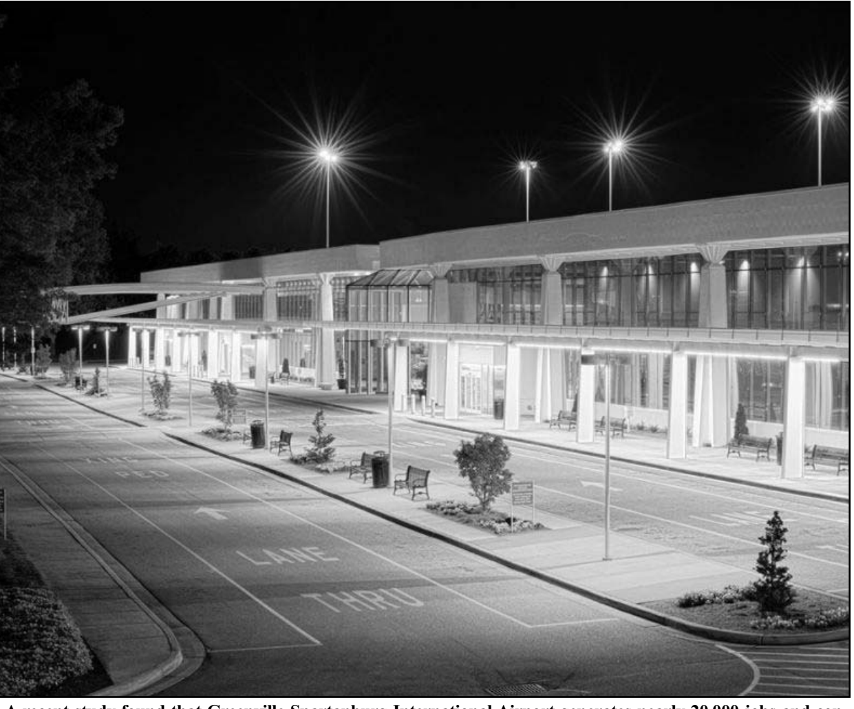
A recent study found that Greenville-Spartanburg International Airport generates nearly 20,000 jobs and contributes $4 billion in economic output to the Upstate South Carolina region.

In 2017, the Greenville-Spartanburg Airport scheduled cargo flights to to accommodate up to six farm and in 2024 work will general aviation terminal.