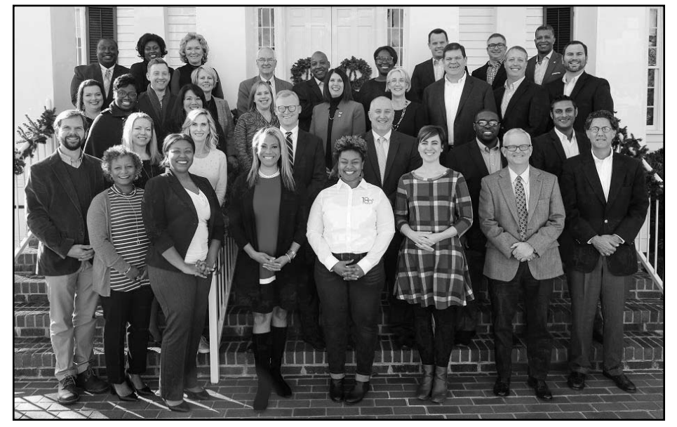
Thirty-six leaders from the Upstate and surrounding area have completed the Riley Institute at Furman's Diversity Leaders Initiative (DLI).

"We are extremely proud of this class, their work to