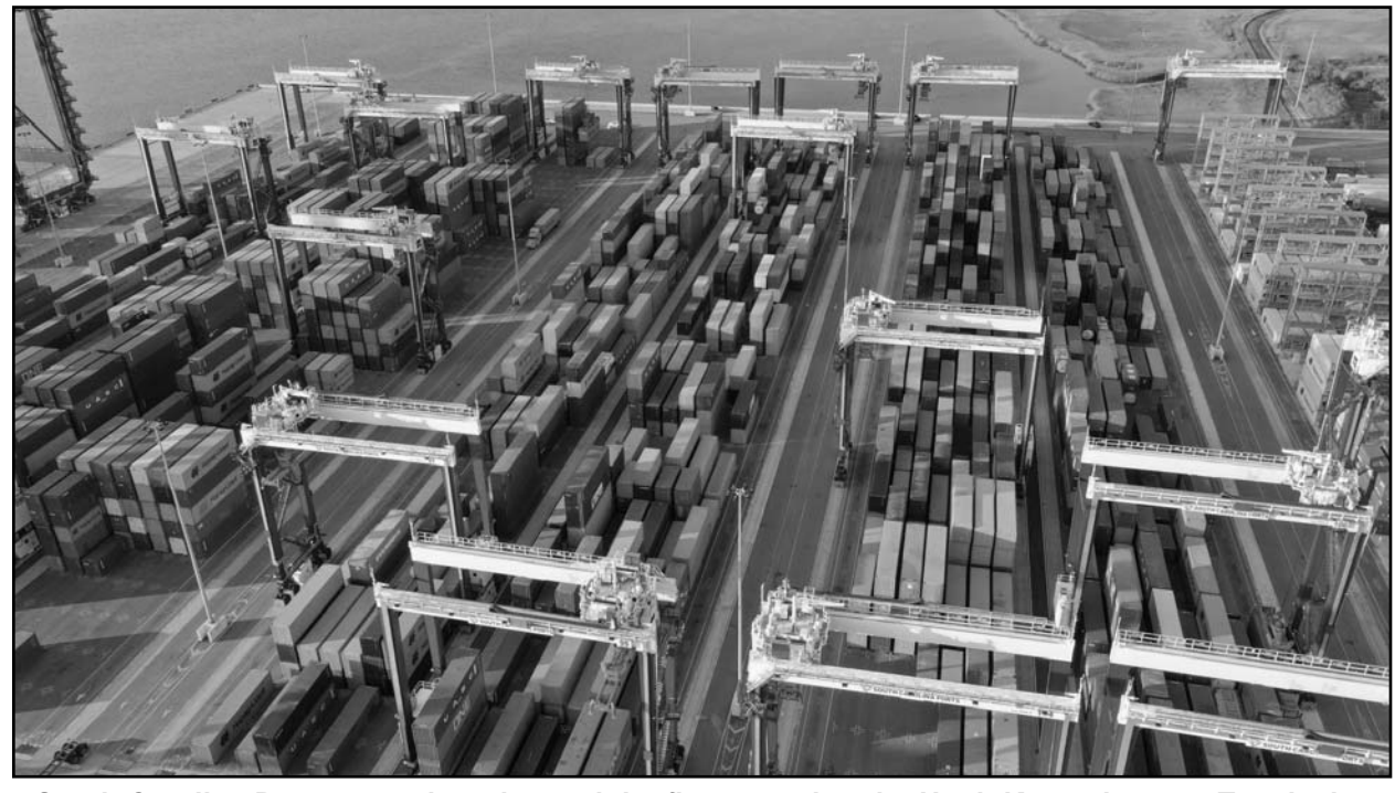
South Carolina Ports recently welcomed the first vessel to the Hugh K. Leatherman Terminal.

The Leatherman Terminal can efficiently work the biggest ships calling on East Coast ports. Phase One adds 700,000 TEUs of throughput capacity to the