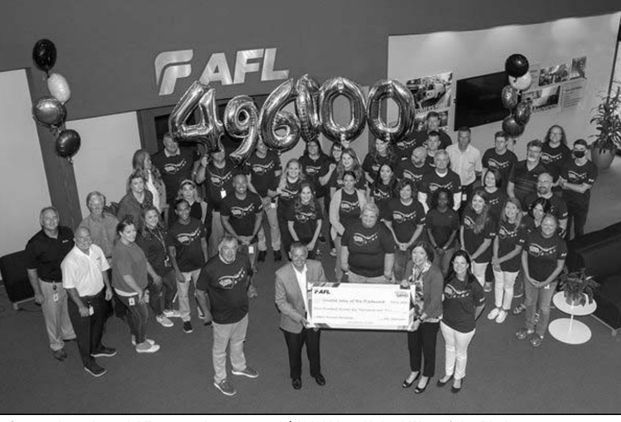
Spartanburg-based AFL recently presented $496,000 to United Way of the Piedmont.

The campaign theme, "Global Games—Give for the Gold," coincided with the upcoming Tokyo Games, which is also the headquarters of AFL's parent company, Fujikura Ltd. During the two-week campaign, associates learned more about the need in the community and were given opportunities to consider a donation. AFL realized a