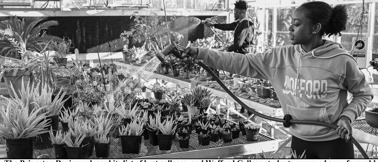
The Princeton Review released its list of best colleges, and Wofford College students surveyed gave favorable reviews of the college's facilities, including its labs and classrooms.

The Princeton Review's list only features about 15% of the four-year colleges in the United States. The publication surveyed