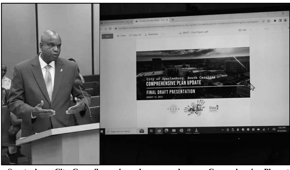
Spartanburg City Council unanimously approved a new Comprehensive Plan at their meeting on Monday, August 14.