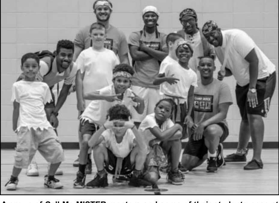
A group of Call Me MISTER mentors and some of their students pose at the Camp iRock closing ceremonies at Liberty High School.

Since its inception the program has expanded to more than 20 colleges across South Carolina and nine universities in other states. Clemson is the largest producer of Call Me MISTER graduates and is responsible for about one-fifth of the 268 MISTER alumni serving as teachers, principals and teacher education faculty members across South Carolina.